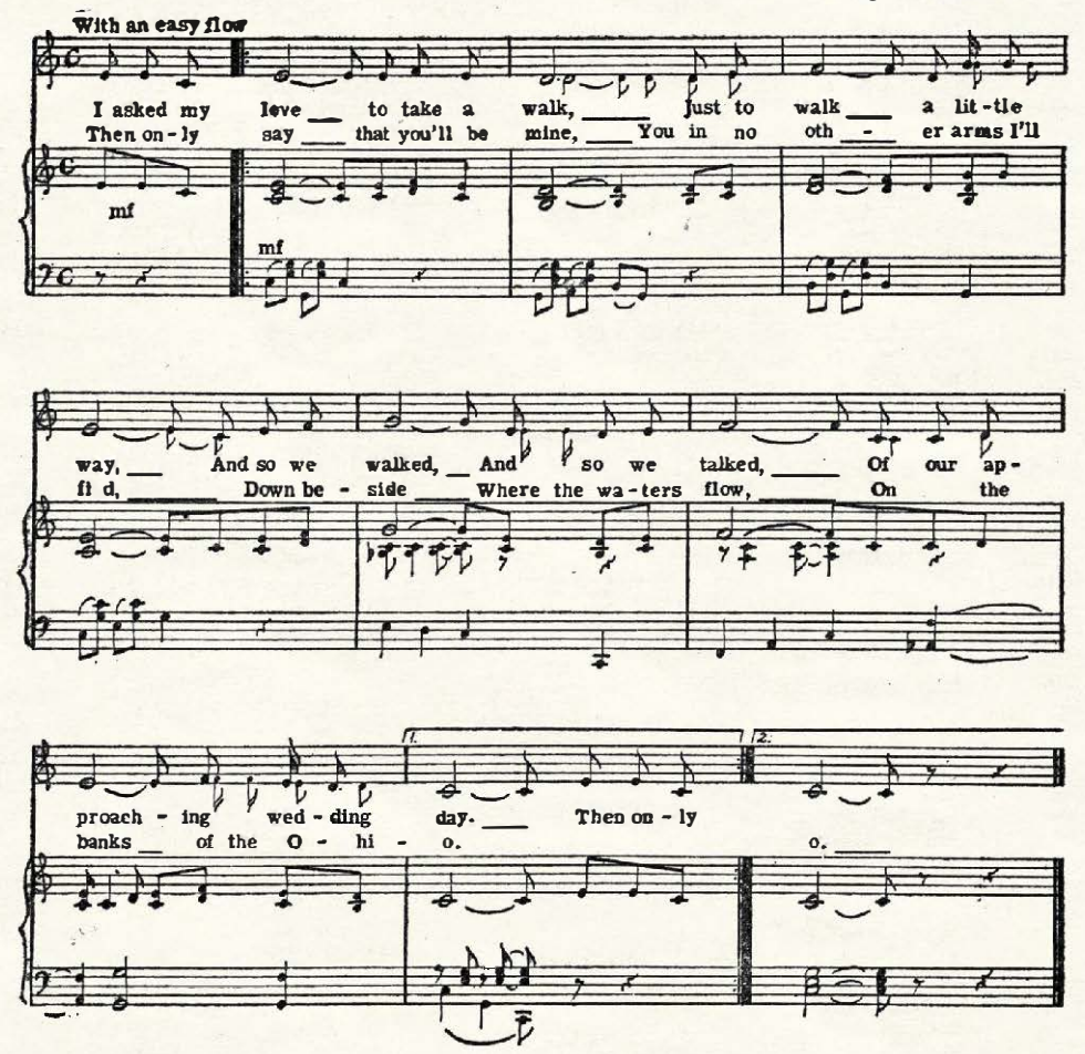
Here are the words of the song that Lee Havs discovered on a share cropper's perch at six o'cleck in the merning, just after he had delivered a baby. To the best of our knowledge this is the first time in detective history that a murder story has been offered complete with music. Why not some night, between singing "The Blue Tail Fly" and "Foggy Foggy Dew," put this page on the music rack of your piano and see how it goes?

American Felksong Arranged by Hille-Veinus